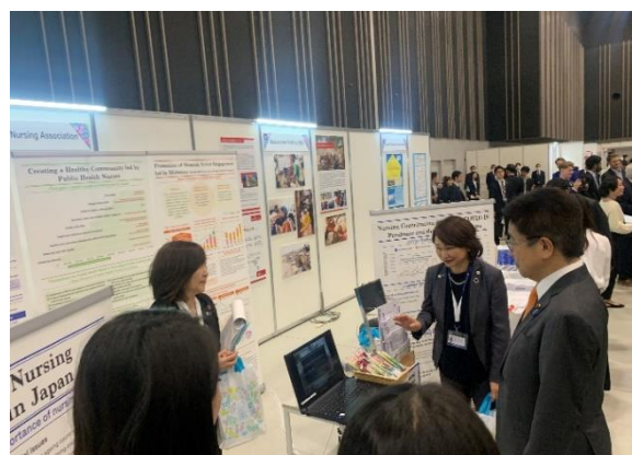
【Photo 4】 Mr. Kato, Japanese Minister of Health, Labour and Welfare (far right)